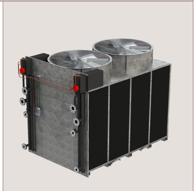
DCH Gen-set radiator unit

3-Phase 400 V-50 Hz squirrel cage induction motors (IEC) are used, on demand 460 V-60 Hz or other power supply. Protection Class IP55, temperature class F or H, depending to the working conditions. On demand greasers can be included. Each electric fan motor is wired to a terminal box or a safety switch close to the fan cowl.